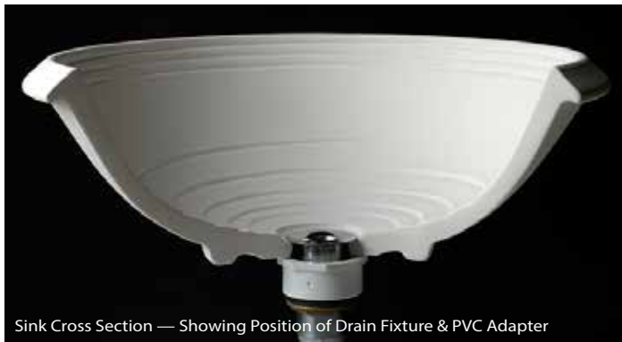
Sink Cross Section — Showing Position of Drain Fixture & PVC Adapter

Drain fixtures are made with different thread take-up lengths and bath sinks are made with different sink bowl thicknesses where the drain is secured to the sink.