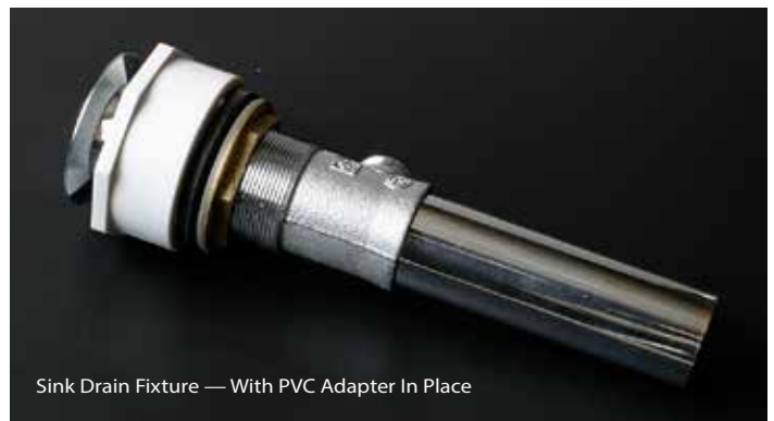
Sink Drain Fixture — With PVC Adapter In Place

The PVC drain adapter is installed as indicated in the cross section photos (at left and below) and as positioned on the example drain above. The underside of the sink drain flange (which faces the sink user) should be sealed with plumber's putty.