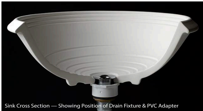
Sink Cross Section — Showing Position of Drain Fixture & PVC Adapter

Drain fixtures are made with different thread take-up lengths and bath sinks are made with different sink bowl thicknesses where the drain is secured to the sink.