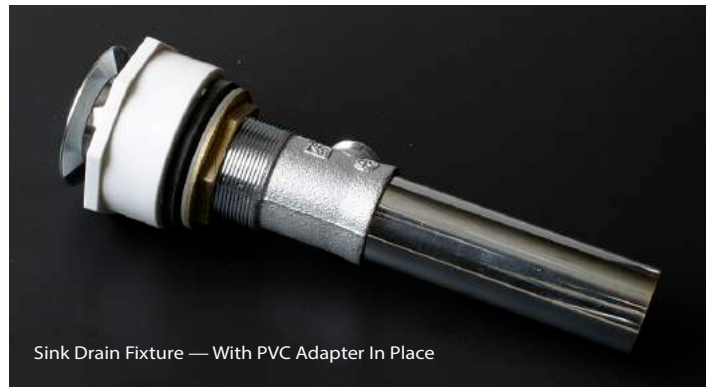
Sink Drain Fixture — With PVC Adapter In Place

The PVC drain adapter is installed as indicated in the cross section photos (at left and below) and as positioned on the example drain above. The underside of the sink drain flange (which faces the sink user) should be sealed with plumber's putty.